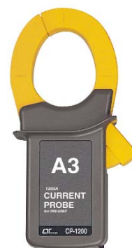
Clamp probess, A1, A2, A3 CP-1200